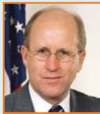
David M. Walker, CPA, AGA's Washington, D.C. Chapter, Comptroller General of the United States, U.S. Government Accountability Office

Certification Board and his support of the CGFM Program.