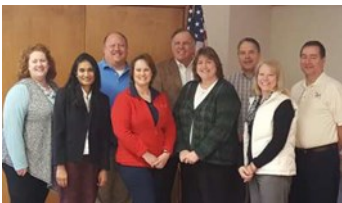
Past Presidents being honored at Annual Breakfast.