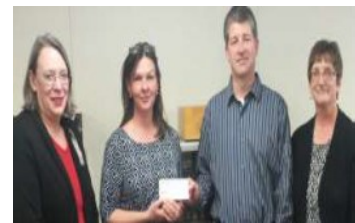
Members give back to community for such organizations as Central MO Food Bank-Buddy Pack Program.