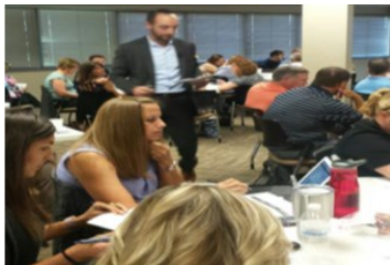
AGA/IIA Members Joint Meeting held annually

Primarily to instruct, train, and inform government financial managers in the field of accounting, auditing, budgeting, systems, and financial management. This continuing education process will provide for the professional development of government financial managers so that they may better serve the public.