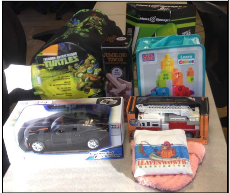
Toys collected at our 12/6 meeting for Toys For Tots

Sound Generations (formerly Senior Services) has connected older adults and adults with disabilities in King County with vital resources to help them thrive. They are a 501 (c) (3) non-profit organization providing seniors with Meals on Wheels and free rides to medical appointments, fitness programs and opportunities for meaningful engagement with others. They alleviate stress by connecting seniors and those who care about them to whatever they need to remain safe, active and healthy and they are committed to helping all people — especially those in low-income communities and communities of color to feel included and respected.