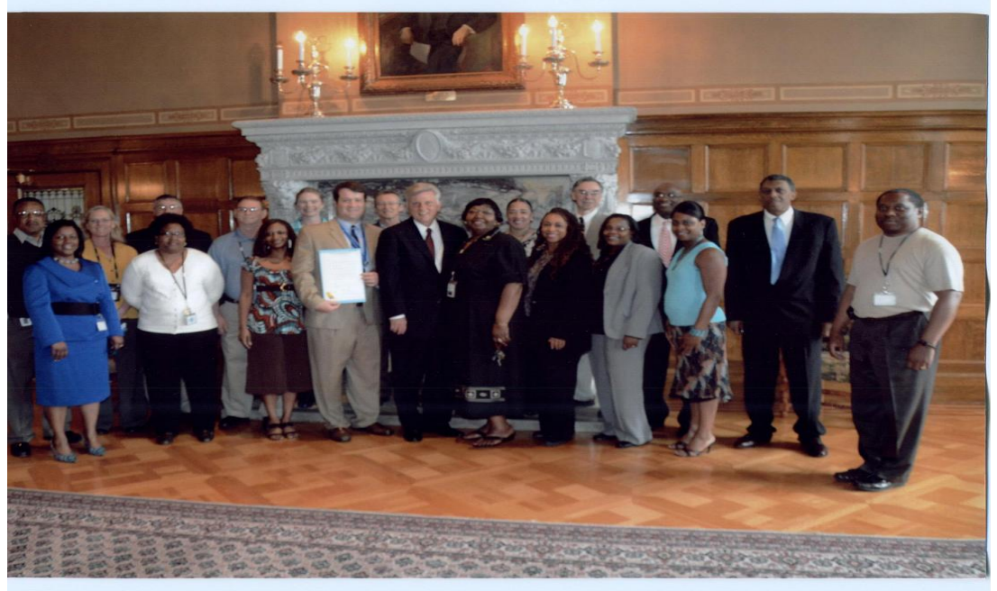
Central Arkansas AGA Members and Governor Mike Beebe