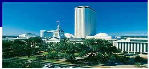
Florida's Capital City