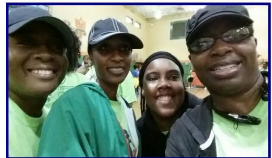
Above: September 2015 Sickle Cell Walk