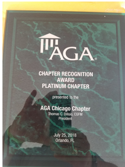
Confirmation of our hard work!