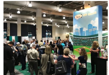
Many vendors were present to share and offer advice and networking opportunities