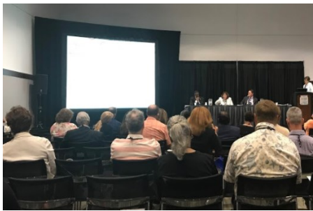
There were many opportunities to attend a variety of sessions with panel, individual, and even tag-team speakers!