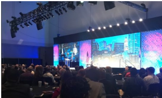
A beautiful opening in a beautiful city! The room was packed with thousands of AGA members from around the country!