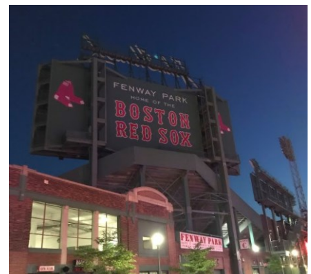
On the off-hours, there was time to go visit the sites and enjoy the Boston life!