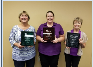
Chapter Recognition Award Platinum Chapter; Chapter Newsletter Award Group D First Place; Chapter Website Award Group D First Place