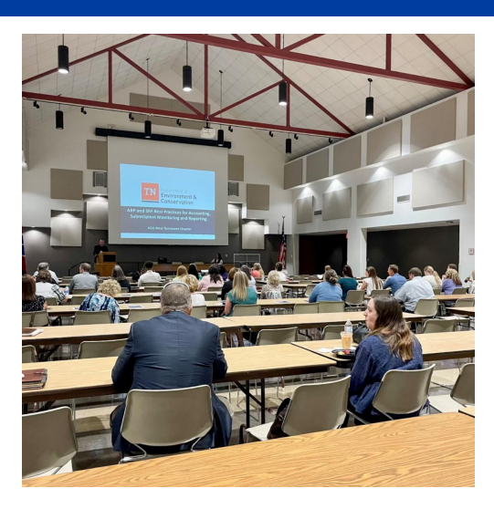
Our West Tennessee Satellite Chapter hosted its 3rd event on July 28th in Jackson. Click to read more and see photos from the event!