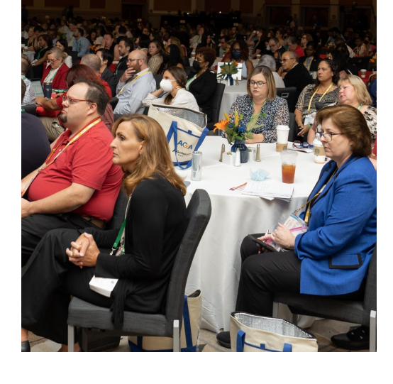
Click to check out photos of the Nashville Chapter at PDT 2022!