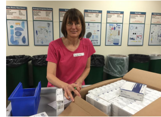
MedShare_ medical supplies for those in need (July2016)