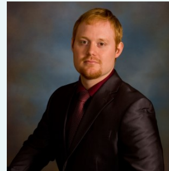
VP of Early Careers and Development