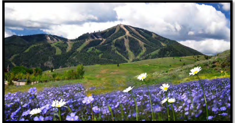
Sun Valley Resort!