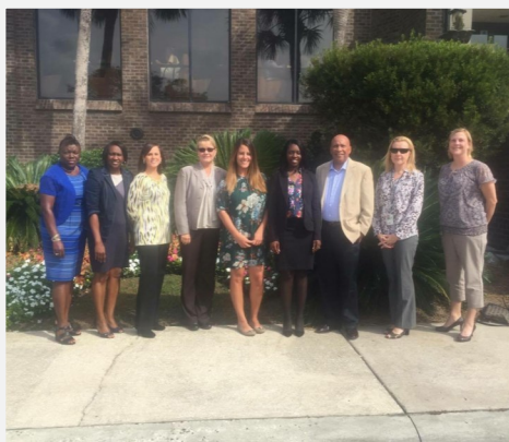
Members joined for lunch at California Dreaming on October 27th.

AGA was pleased to hold the following events for our members over the past quarter. Please feel free to attend the future social events. The more the merrier! Luncheons, social hour, and holiday celebrations allowed members to enjoy and learn more about each other.