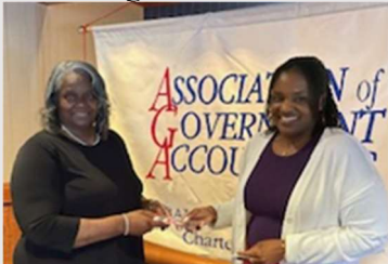
Elouise Evans Community Service Award