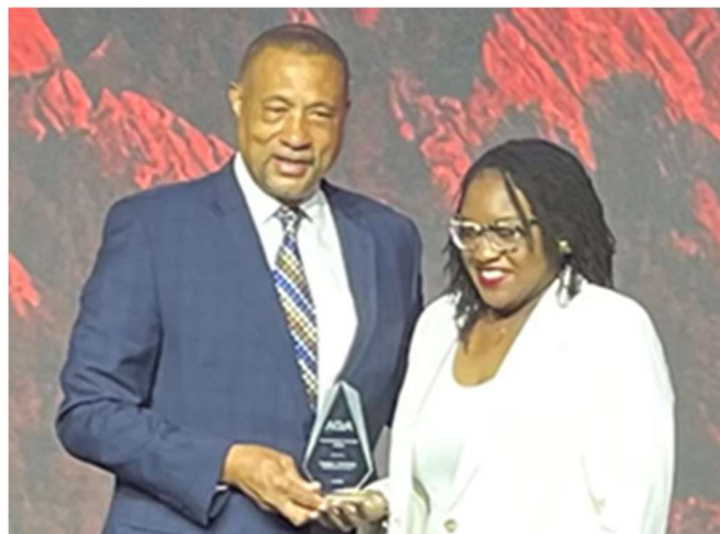
AGA National Volunteer of the Year