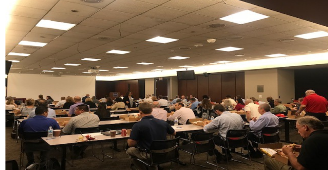
2018 Chicago Chapter PDT