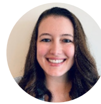
Eryn Steckroth Communications