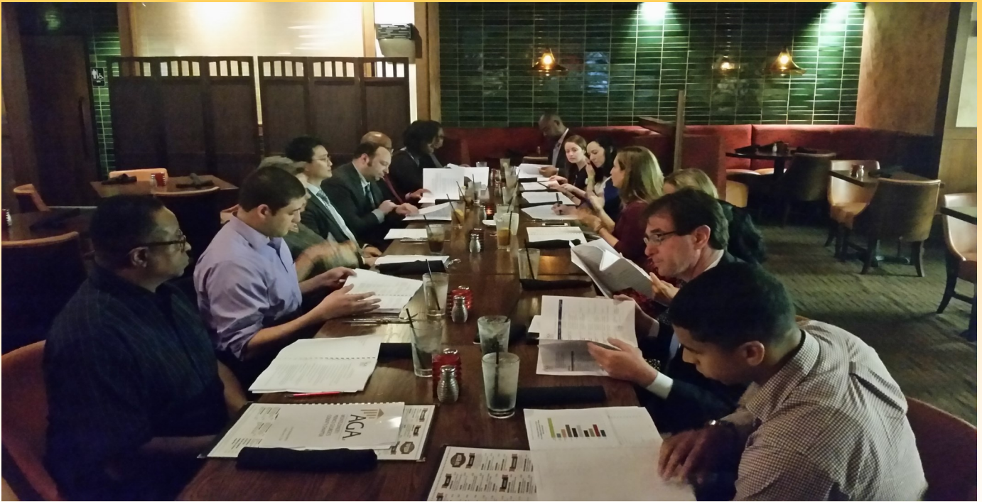
The Montgomery/Prince George's County Chapter Board met for the Annual Planning Meeting on June 21, 2016 to discuss the annual budget and upcoming events for the 2016-2017 program year.