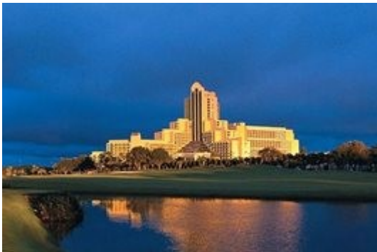
Orlando World Center Marriott and Convention Center