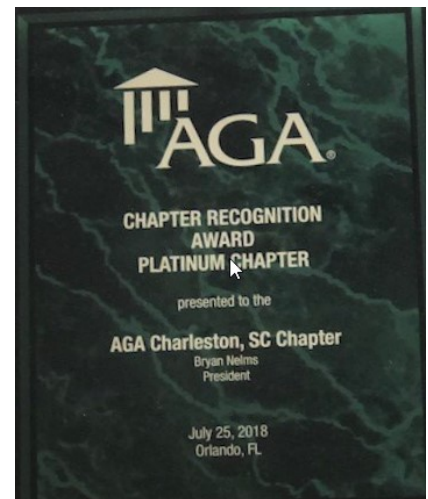
Chapter Recognition Award: Platinum Chapter AGA Charleston Chapter July 2018