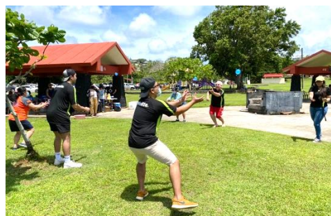
Resiliency: Turning Obstacles into Opportunities