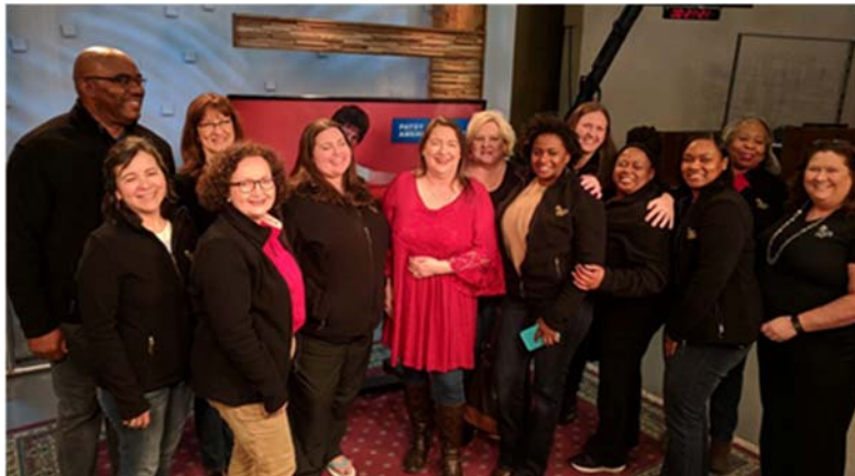
Pictured Above: March 2018 Nashville Public Television’s membership drive during programming for Patsy Cline: American Masters and Celtic Women Homecoming