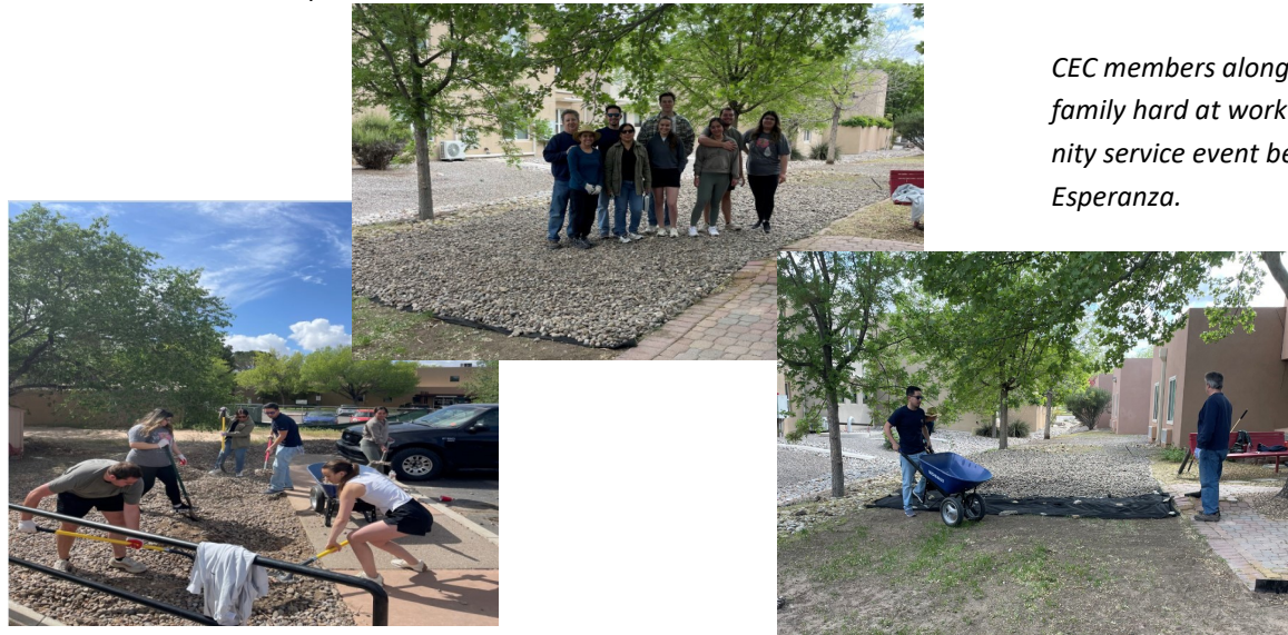
CEC members along with friends and family hard at work during a community service event benefitting Casa Esperanza.