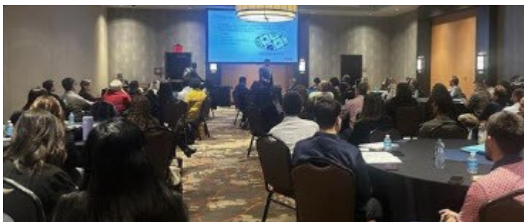
The 2024 NM and Albuquerque Chapter PDT provided attendees with the opportunity to receive quality CPE's at a low cost

The Albuquerque Chapter Executive Committee reviews the monthly financial statements