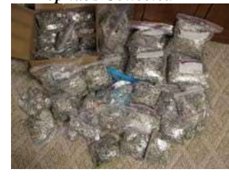
Pop tabs Collected

Our Chapter is active in serving the community. The Chapter's Pop-Tab project continues to benefit the Friends of Indian Summer Camp for cancer-patient children to enjoy a week at camp. Each chapter meeting includes activities to help promote local groups, including senior citizens, Habitat for Humanity, and Simon House, a shelter for women and children.