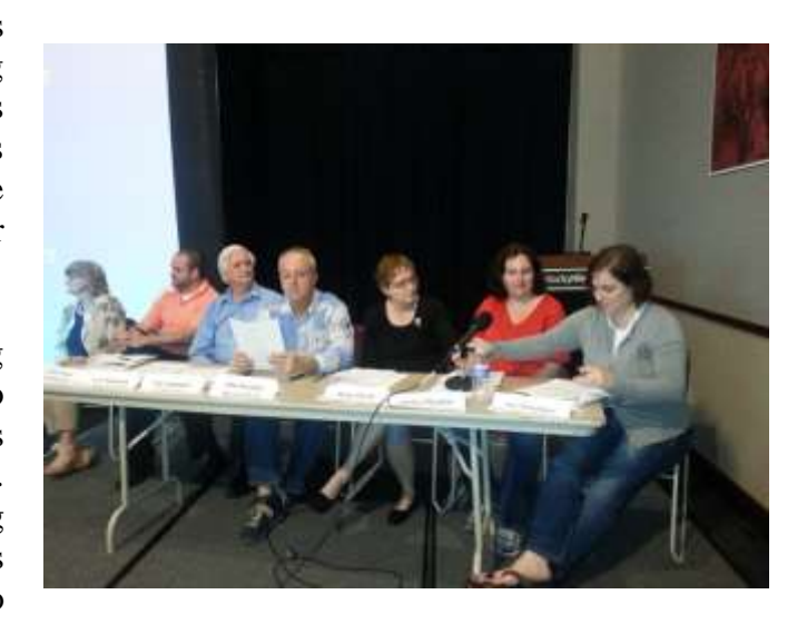
Case Study Group 2nd Annual Spring Conference, May 2013

We need to ensure our members see the value of being members of the Central Kentucky Chapter. To accomplish this, we offer deep discounts to members who attend our training events and monthly meetings. We also strive to provide excellent training opportunities with quality speakers and keep members informed of chapter activities. Offering a scholarship to college students in the accounting field is how we hope to encourage those young future professionals to join AGA and participate in Chapter activities.