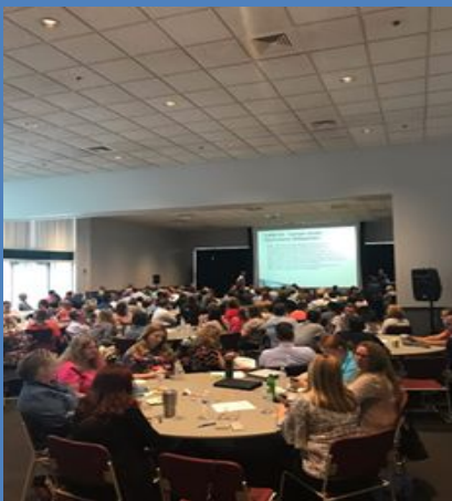
Fall Training Event