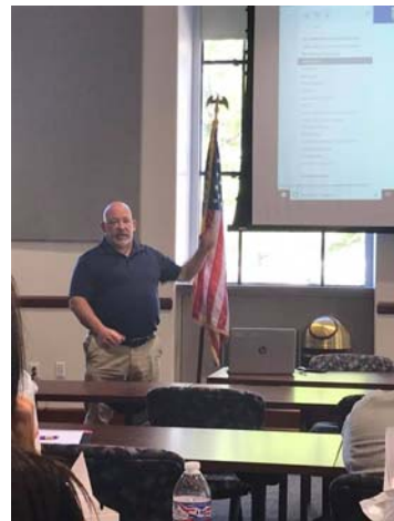
Office 365 at the Capitol Complex