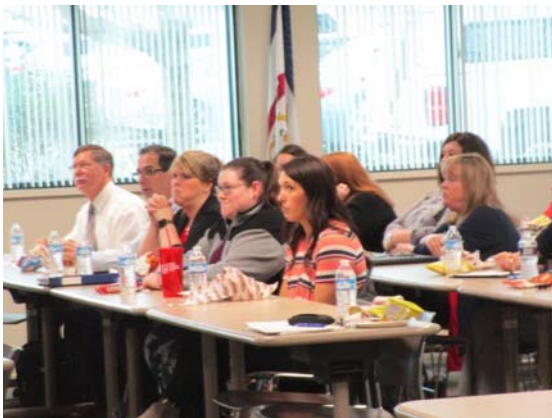
Analytical Reviews @ DEP