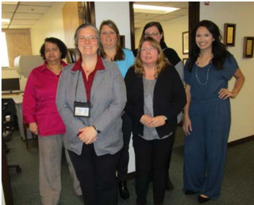
CGFM Study Group