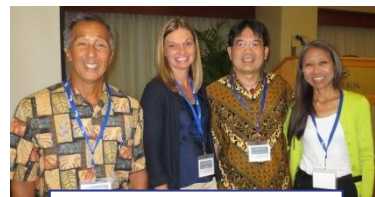
Government Professional Accounting Seminar

The AGA Hawaii Chapter has been offering its members a number of affordable opportunities to further their knowledge and keep current on the latest technologies, governmental auditing and financial reporting issues while earning Continuing Professional Education (CPE) credits to maintain and enhance their professional careers. These opportunities include sponsoring Hawaii Chapter's annual Government Professional Accounting Seminar, luncheon meetings and seminars. The Chapter also joined the University of Hawaii School of Accountancy lecture series that introduced UH accounting students and alumni to government terms and processes, including budgeting, accounting, financial management, and auditing. The focus of the training is to provide its membership with the most current developments affecting or impacting governmental financial accounting, reporting, internal controls, and Governmental Auditing Standards. The Chapter also makes the training and CPE opportunities available to non-members.