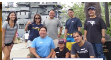
Volunteering at USS Missouri