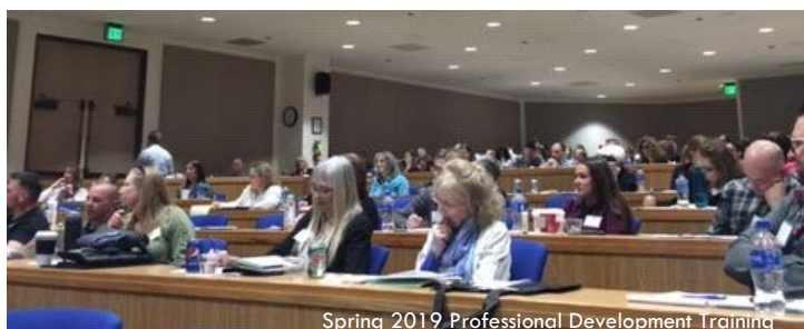
Spring 2019 Professional Development Training