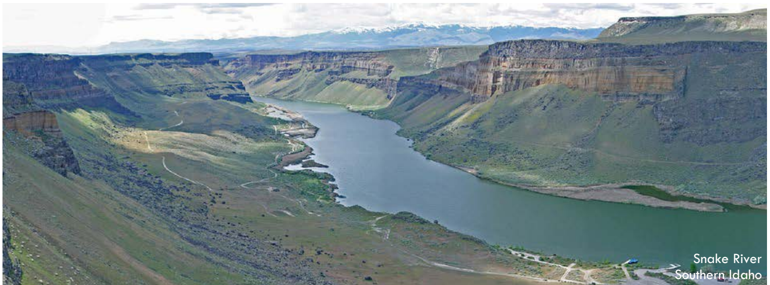
Snake River Southern Idaho