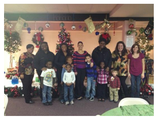
Several happy families pose at the party.