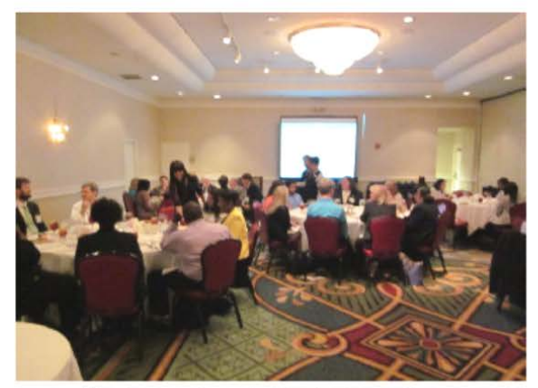
Members and guests mingle during dinner.