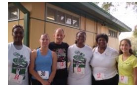
AGA members in a recent 5K Run/Walk to benefit the Sickle Cell Foundation

We take pride in the leadership opportunities our chapter provides. We focus on leadership opportunities in our annual government training event in an effort to empower members to step up and be responsible for some portion of the training. Their successes and experiences in these endeavors better prepare them to seek out leadership opportunities not only within our chapter, but also in their careers. The chapter offers cash scholarships to individuals on the basis of the candidate's potential for making a meaningful contribution to public financial management and the candidate's involvement in the community. Recently, the chapter has offered two $500 awards and this trend is expected to continue.