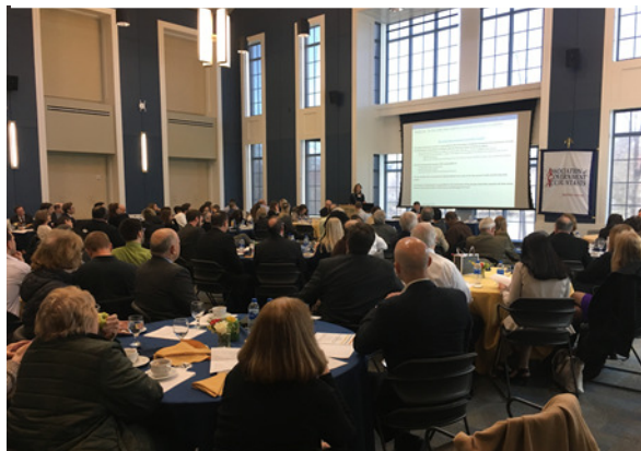
2018 Spring Symposium presentation held at TCNJ