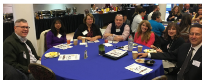
2017 Fall Seminar

Independent audits of the Association's finances were conducted, resulting in clean opinions.