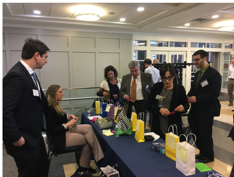
2018 Spring Symposium