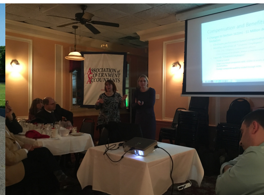
January 2018 Dinner Meeting Mercadieu Tax Update