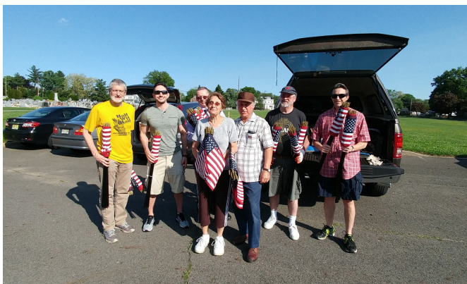
May 2018 Veteran Flag Placing Community Service