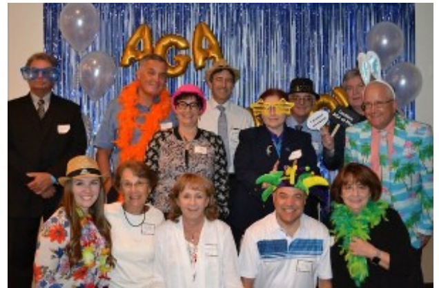
Past Presidents having some photo booth fun at AGA's 40 th Anniversary Celebration