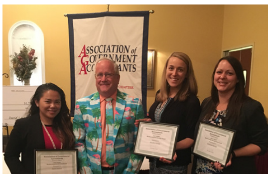
2018-2019 Membership Scholarship Recipients at AGA's Award's Dinner