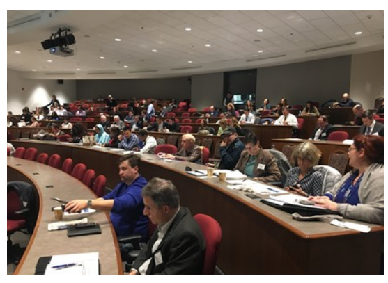
2018 Fall Seminar presentation held at MCCC

AGA is to be the premier association for advancing government accountability.