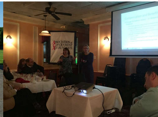
January 2018 Dinner Meeting Mercadieu Tax Update