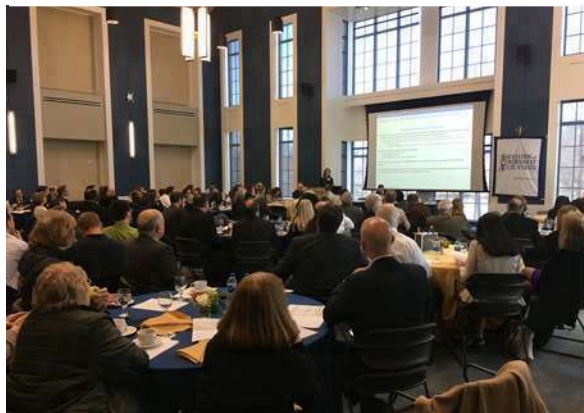
2018 Spring Symposium presentation held at TCNJ