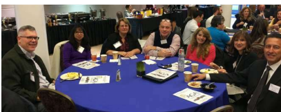
2017 Fall Seminar

Independent audits of the Association's finances were conducted, resulting in clean opinions.