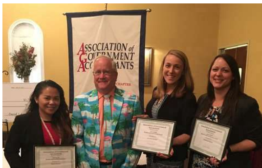
2018-2019 Membership Scholarship Recipients at AGA's Award's Dinner