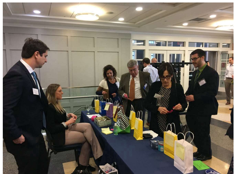
2018 Spring Symposium