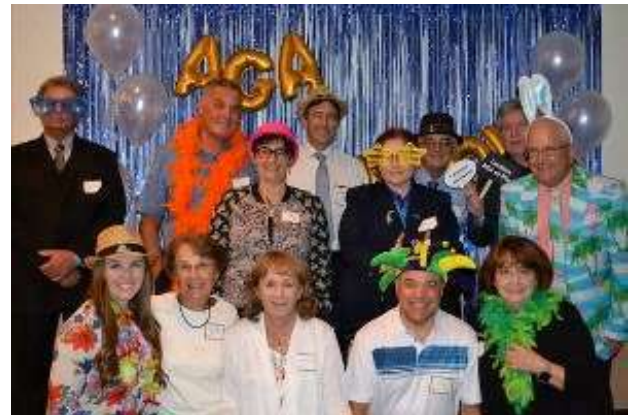
Past Presidents having some photo booth fun at AGA's 40 th Anniversary Celebration