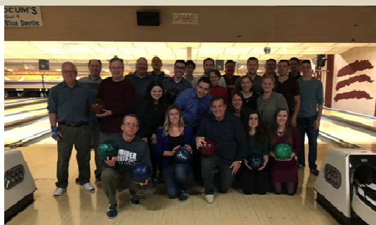
2018 Bowling-Networking Event at Slocum's