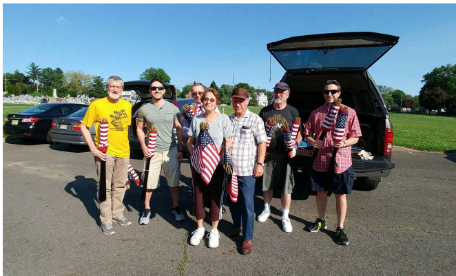
May 2018 Veteran Flag Placing Community Service