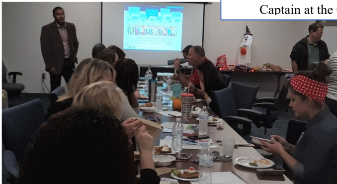
We visited the GAO office in Virginia Beach to speak about the benefits of membership.