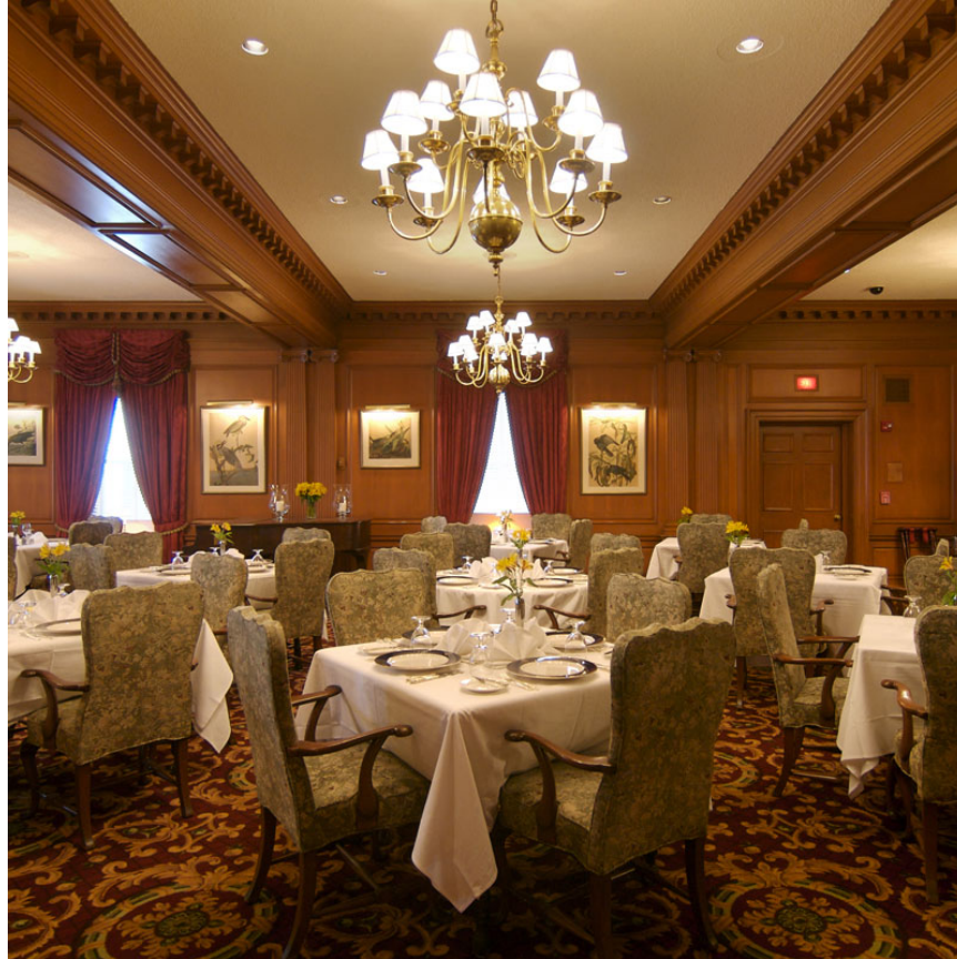
University Club 1135 16th Street, NW