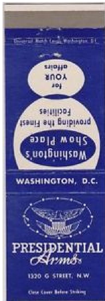
The Presidential Arms Hotel 13 th & G Streets, NW (until 1981)