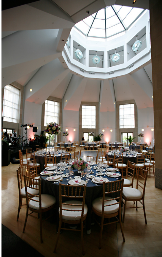
Ronald Reagan Building and International Trade Center 1300 Pennsylvania Avenue, NW