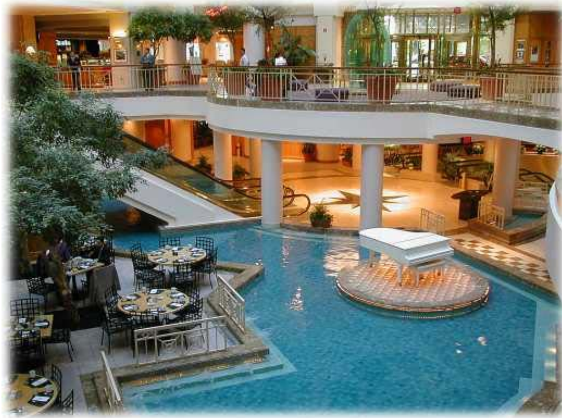
The Grand Hyatt Hotel at Metro Center 1000 H Street, NW