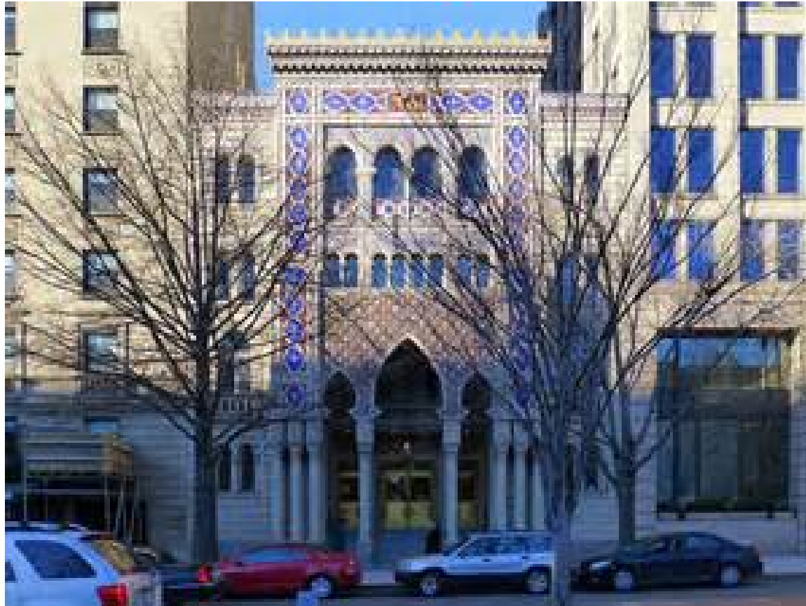
Almas Shriners Masonic Temple 4441 Wisconsin Ave NW