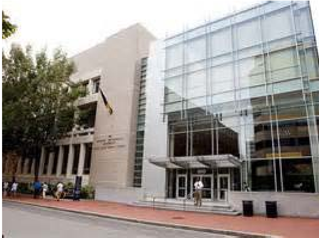
George Washington University Marvin Center 800 21 st Street, NW