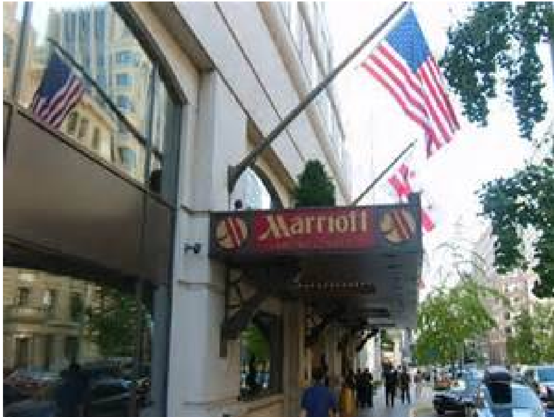
Washington Marriott at Metro Center 775 12 th Street, NW