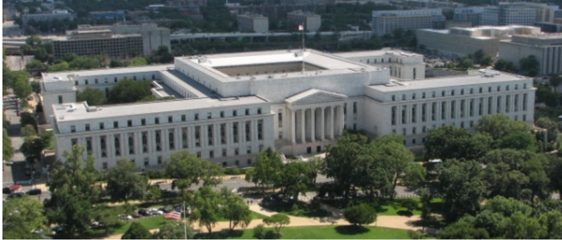
Sam Rayburn House Office Building 45 Independence Avenue, SW (built 1965)