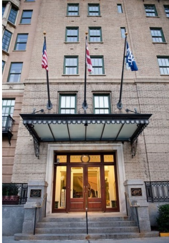
Army & Navy Club 901 17 th Street, NW