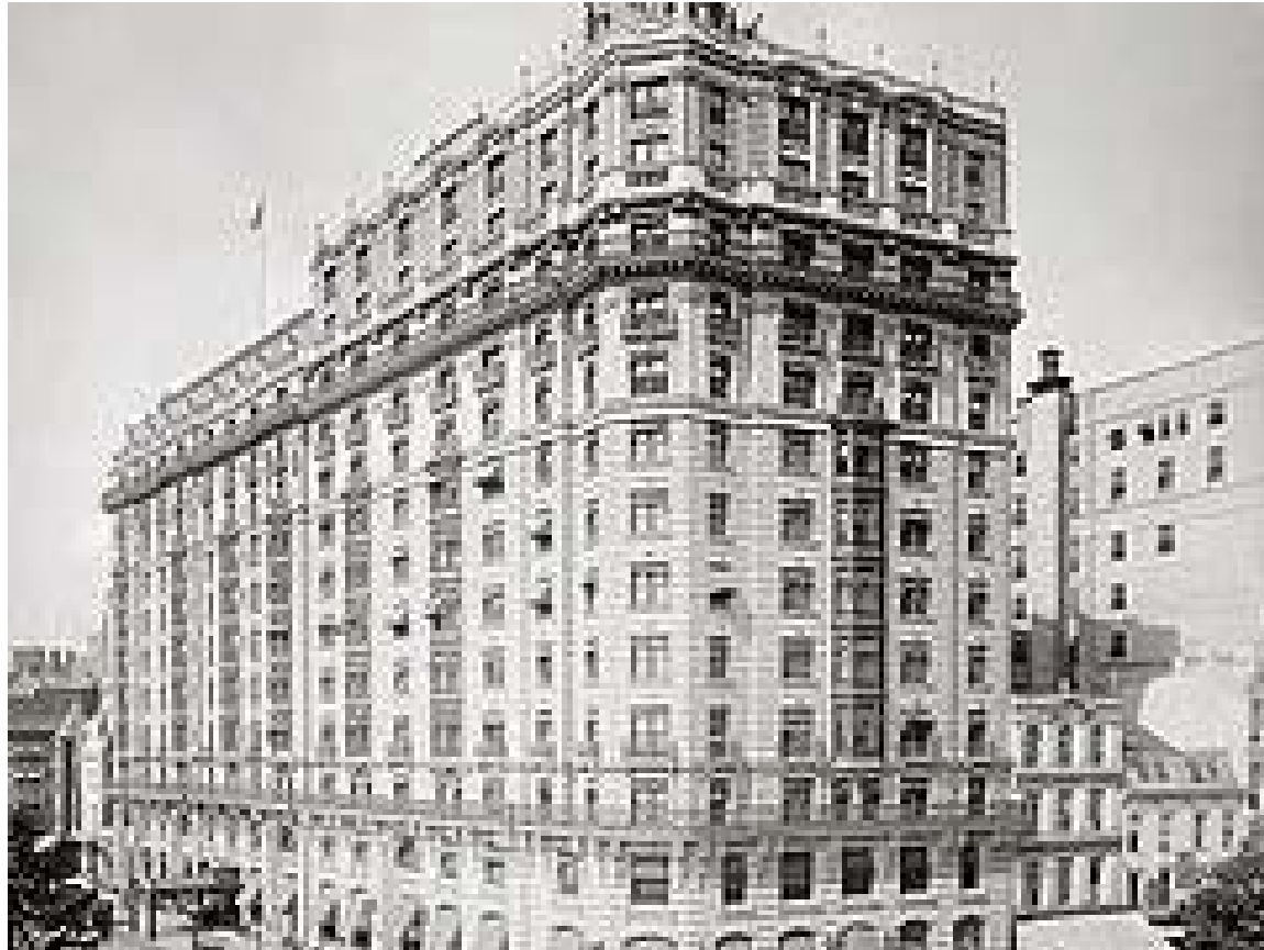
The old Raleigh Hotel 12th Street & Pennsylvania Avenue NW (until 1964) First meeting: September 14, 1950