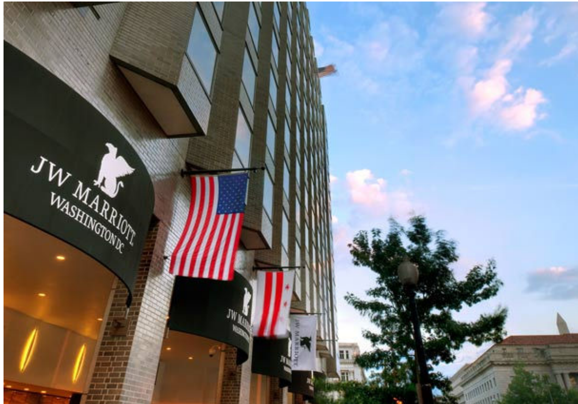
JW Marriott Hotel 1331 Pennsylvania Avenue, NW