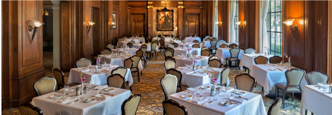
Army & Navy Club 901 17 th Street, NW