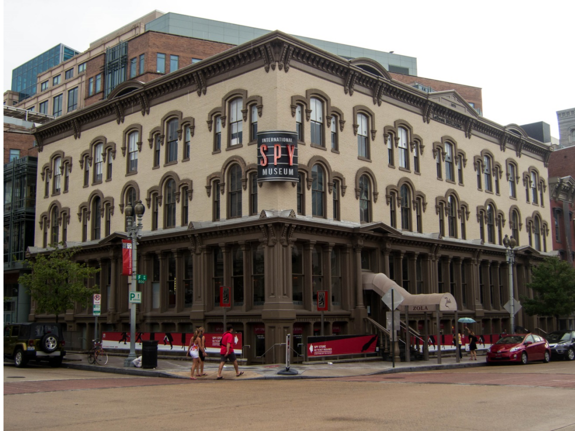
Zola Restaurant Adjacent to the International Spy Museum 800 F Street, NW (until June 2012)