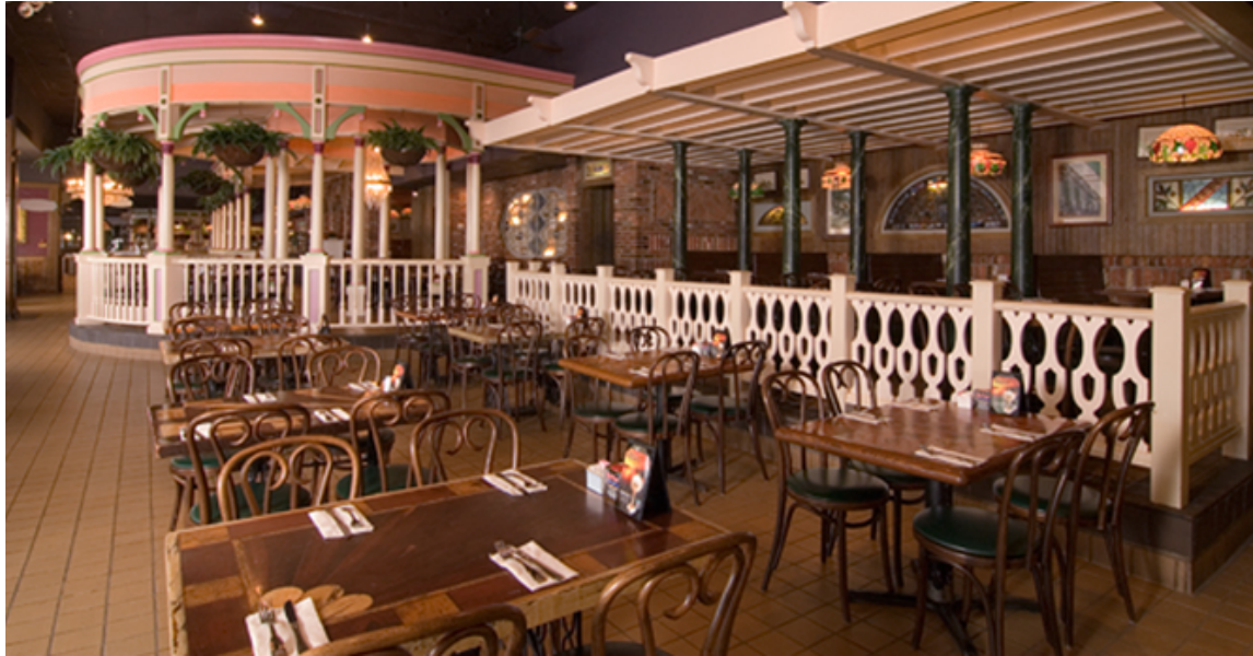
Phillips Flagship Seafood Restaurant 900 Water Street, SW “Gone But Not Forgotten”