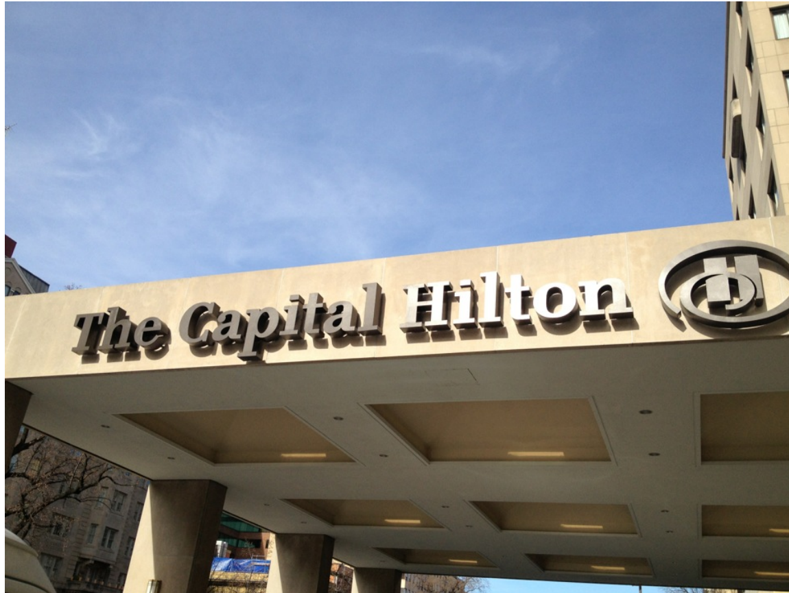
The Capital Hilton Hotel 16 th & K Streets, NW