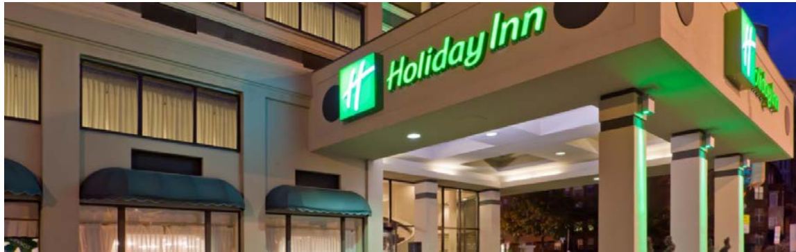
Holiday Inn at Thomas Circle 1501 Rhode Island Avenue, NW