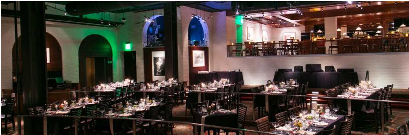
The Hamilton 600 14 th Street, NW