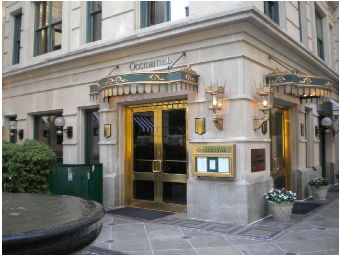
Occidental Restaurant 1475 Pennsylvania Avenue (since 1906)