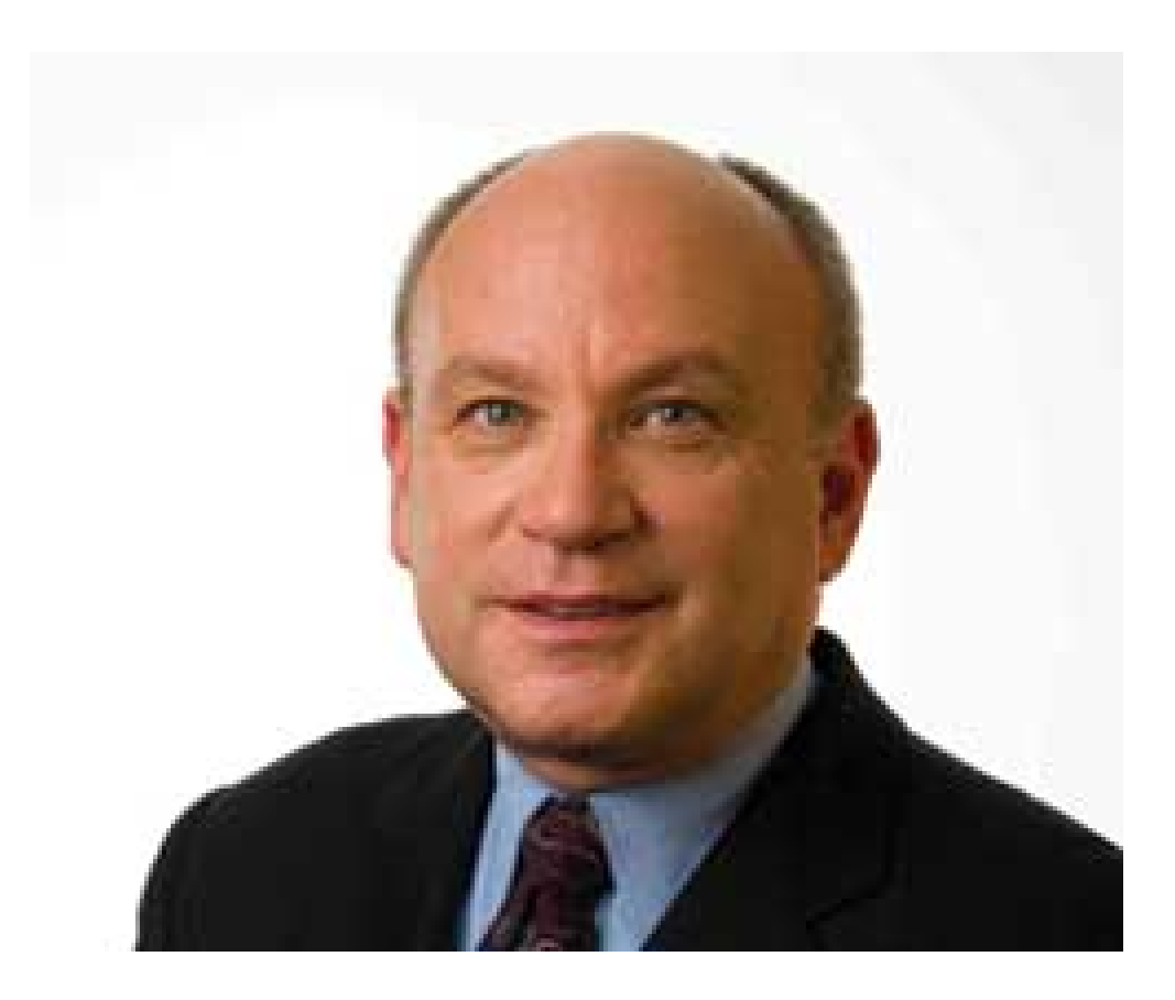
2008- Stan Collender

Stan Collender, leading expert and writer on federal budget and fiscal issues, and among a handful of people who have worked for both the House and Senate budget committees, spoke on federal budget issues in December 2008.