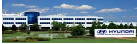
Hyundai Motor Manufacturing Plant