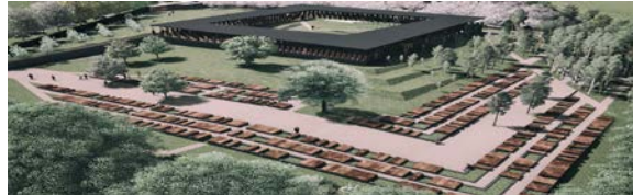
National Memorial for Justice and Peace