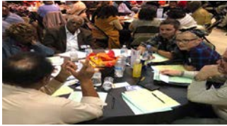
Citizens participating in Envision 2040

Fiscal Year October 1, 2017- September 30, 2018