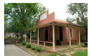
Store in Old Alabama Town historic district