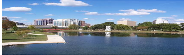
City of Montgomery, riverfront