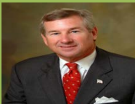
Mayor Todd Strange