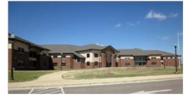
Johnnie Carr Middle School