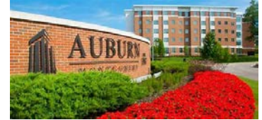
Auburn University Montgomery