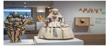
Montgomery Museum of Fine Arts