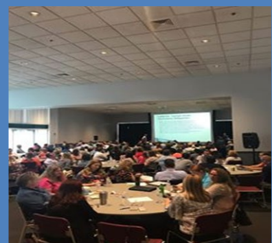
Fall Training Event