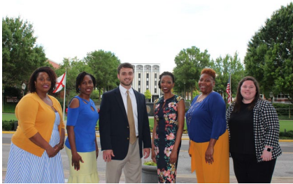
Montgomery AGA Chapter Officers Program Year 2020-2021

Do you like this report? If you would like to see other information or if you would like more information on our services, visit our website at: www.montgomeryaga.org