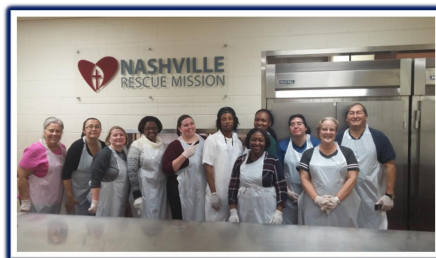
Nashville Rescue Mission

The Nashville Chapter has a long history of giving back to our community by providing members numerous opportunities throughout the year to donate and volunteer in support of local charities.