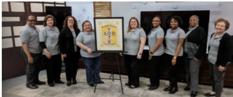
Pictured Above: March 2020 – Nashville AGA volunteers at Nashville Public Television’s membership drive.