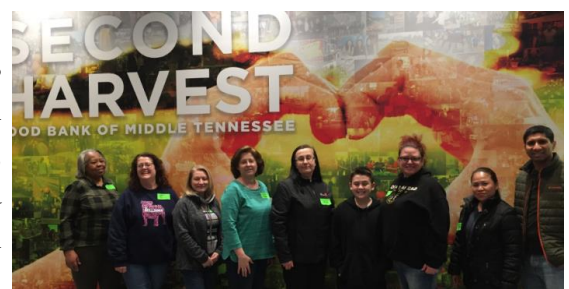
Second Harvest Food Bank

For over 15 years, our members have supported a local school with monetary donations, donations of school supplies, and volunteers for various school events.