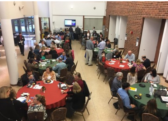
2019 Fall Seminar held at MCCC

AGA is to be the premier association for advancing government accountability.