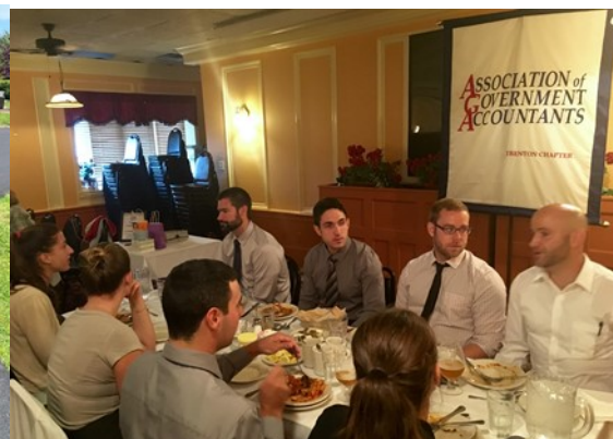
Monthly Dinner Meeting