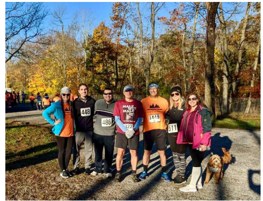
AGA Trenton Members at the Paul Vidunas Charity, PCDI Walk