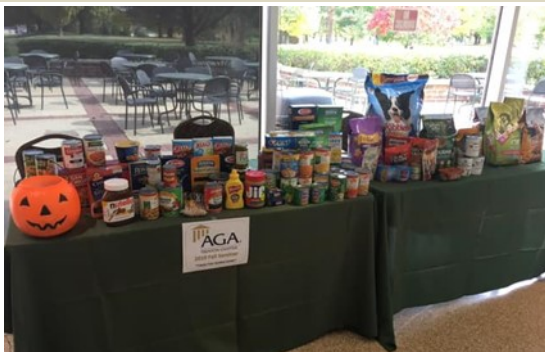
Trenton Soup Kitchen and Animal Shelter donations collected at our 2019 Fall Seminar