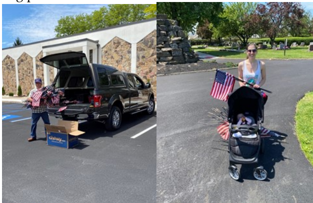
2020 Veteran Flag Placing Community Service