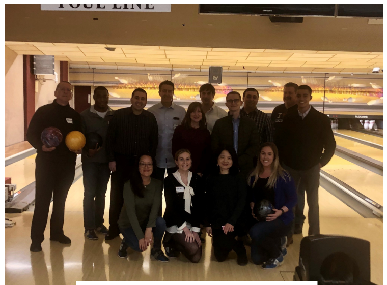
2020 Annual Bowling – Networking Event