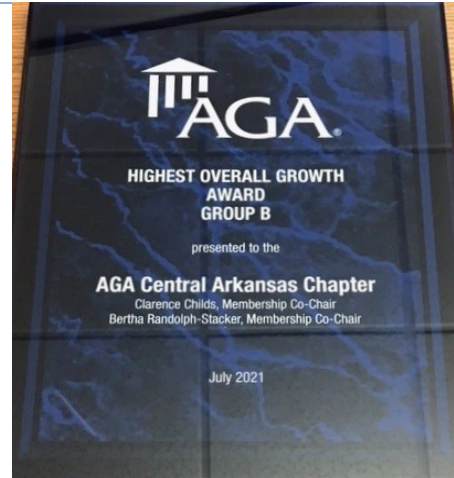
Highest Overall Growth Award Group B July 2021

Revenue decreased due to moving our events to virtual events. The chapter had a two-day spring seminar which was free to members, this was done due to the hardship of COVID-19 Pandemic.