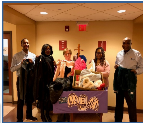
AGA January Coat Drive