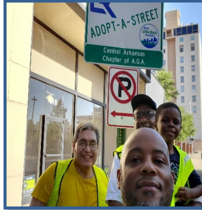
Adopt a Street and volunteer clean ups