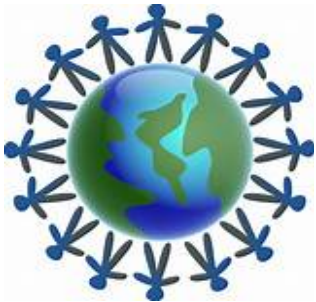
AGA January Coat Drive