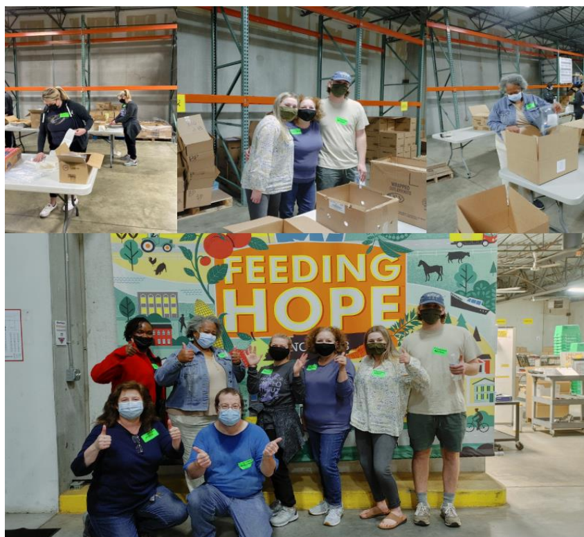
Pictured Above: May 2021 – Nashville AGA volunteers at Second Harvest Food Bank.