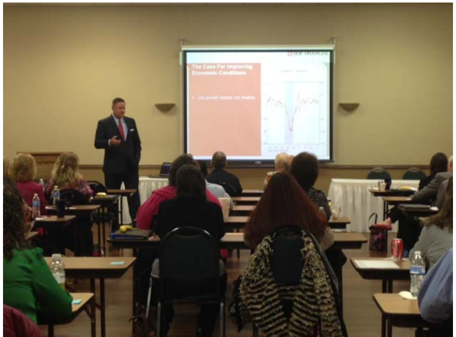
A speaker from Bank of Kansas City discussed an economic update during the Spring 2014 Seminar.

The Ozarks AGA Chapter commits to taking a leading role in promoting the Citizen Centric Report (CCR). Providing the public with this timely, simple information will be a key factor in continuing to promote our organization.