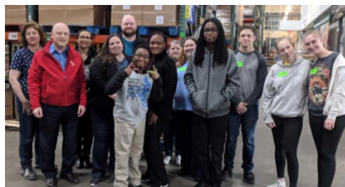
Second Harvest Food Bank