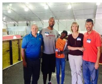
Metropolitan Ministries Food Tent AGA and ASMC Teaming Together

Tampa is setting a goal to at least have one volunteer event every quarter, provide students with scholarships from AGA and enroll students in the annual finance management graduate and undergraduate problem solving competition.