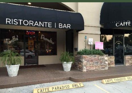
Roux Restorante, S. MacDill Ave. Tampa Bay First Chapter Membership Meeting