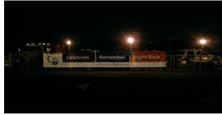
Relay for Life