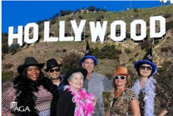
Networking at AGA National's PDT Anaheim, CA