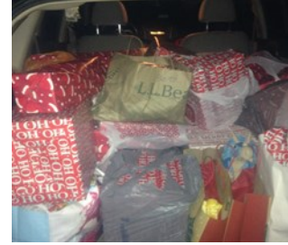
Adopt a Family Bright Futures