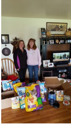
“Pet Supplies for MEOWeRY Rescue Shelter”