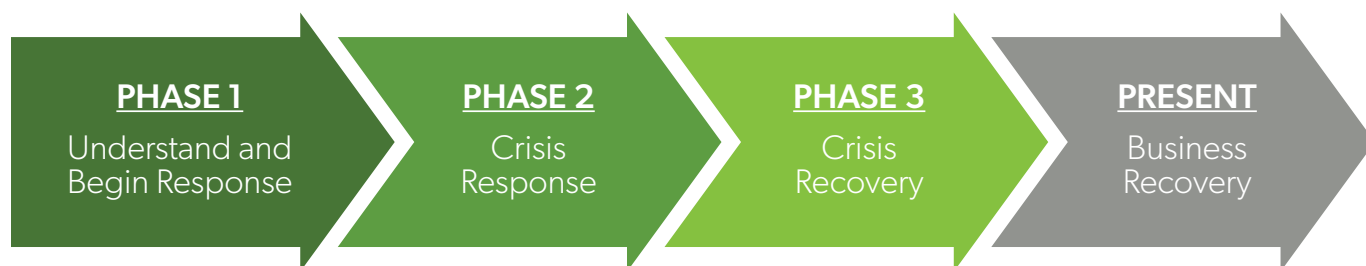
Figure 1: A Model of Event-Horizon Planning

Agencies are reacting to the COVID-19 pandemic differently, resulting in new and creative thinking on the performance of day-to-day operations as well as