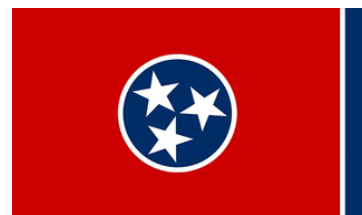
Tennessee State Flag